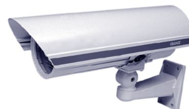
Housing and bracket assembly dimension (mm)